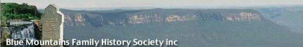
Blue Mountains Family History Society inc

If you would like to propose some topics, have some issues which you would like some input from fellow societies, or just a topic for discussion, please email the Association with an outline.