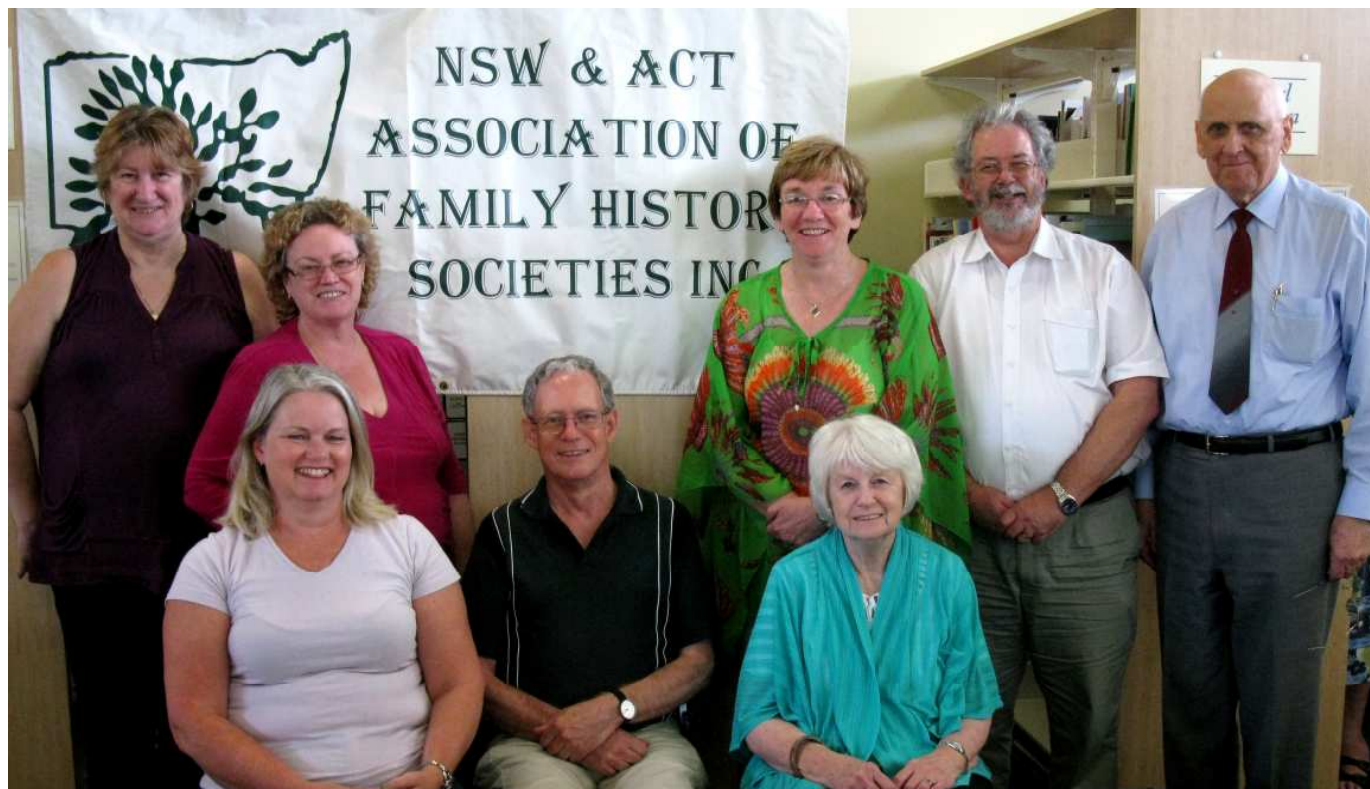
Committee Members at 26th February 2013 - Botany Bay Family History Society.