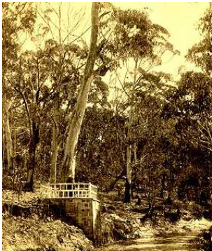
The Explorers' Tree, Katoomba, 1886

The theme Following in their Footsteps is in relation to the celebration of the crossing of the Blue Mountains 2013-2015.